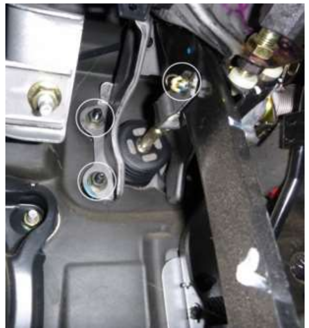
Image 1.3 Removal of the cotter pin and nuts.

Remove the four 12mm headed nuts that secure the booster to the firewall - save these nuts, cotter pin and main pin as they are reused on the hydraulic booster