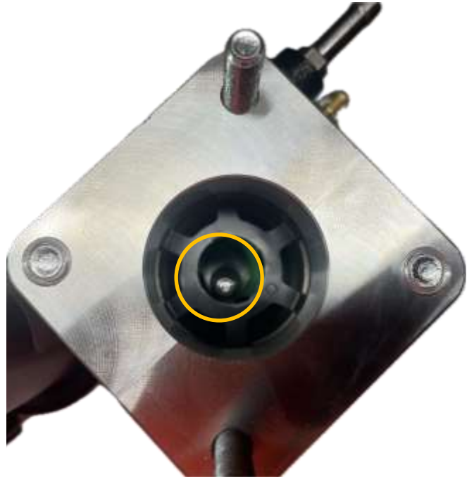
Image 2.1 Make sure the push rod is fitted in the hydro booster

Make sure the push rod is fitted to the hydro booster – this is retained internally – as per image 2.1