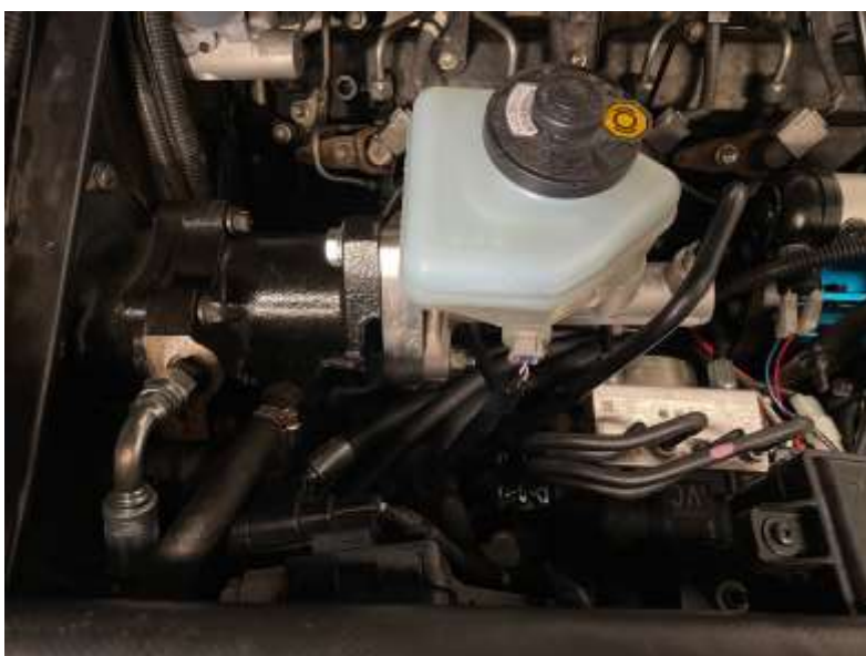
Image 2.5 Fit the master cylinder to the hydro booster

Check the brake/stop switch clearance is between 0.5 to 2.4mm & confirm brake lights are working as required.