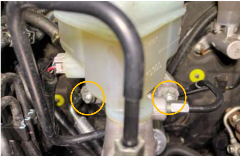
Image 1.2 Remove nuts holding master cylinder to booster

Remove the 2 nuts that are holding the master cylinder to the brake booster.