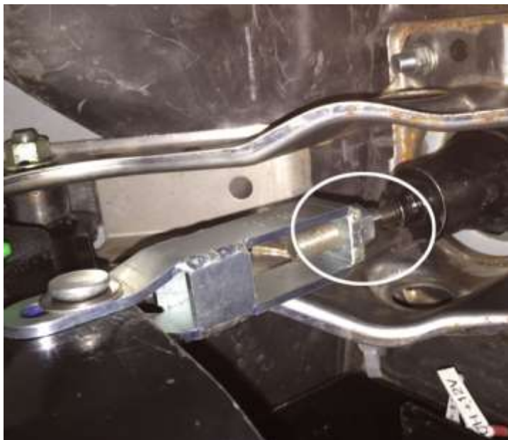
Image 2.4a Adjust the pedal saddle

You will need to adjust the pedal saddle by using an 8mm spanner across the flats (as circled in the photo Image 2.4)