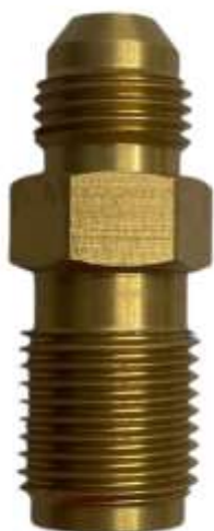
Image 3.1 Power steering box adaptor fitting

Note: Once you crack this line power steering fluid will drain out – have a bucket and rags ready.