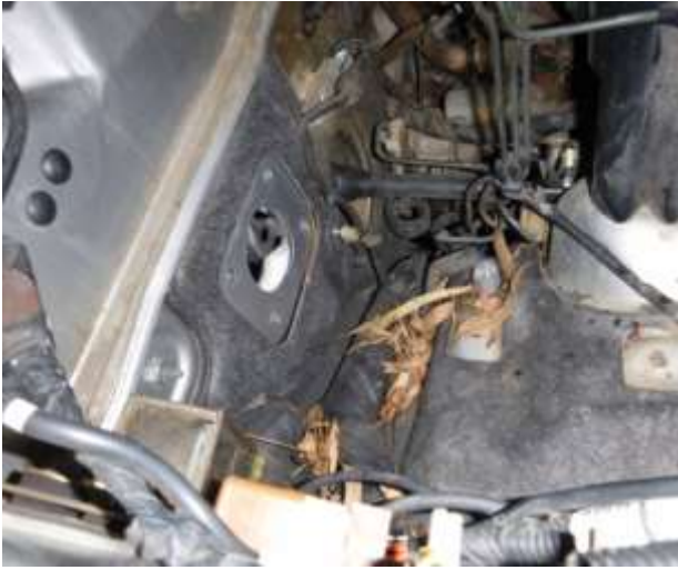
Image 1.4 Booster removed

Disconnect the vacuum pipe that runs between the booster and vacuum reservoir. The booster can now be removed from the firewall.