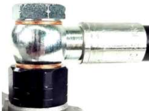
Image 3.5a & b Power steering pump fitted with new hose