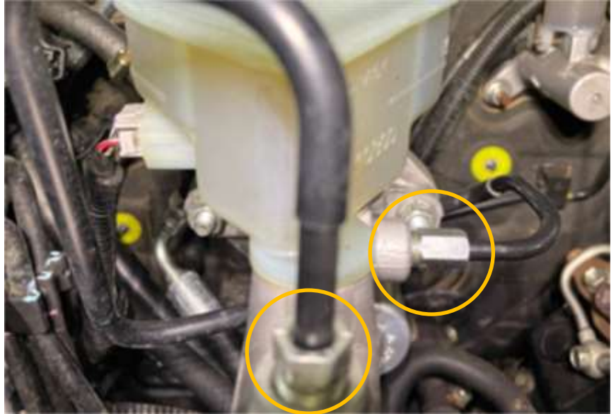
Image 1.1 Disconnect the solid brake lines

These solid lines need to meet back up with the master cylinder once it is reinstalled running from the master cylinder to ABS unit.