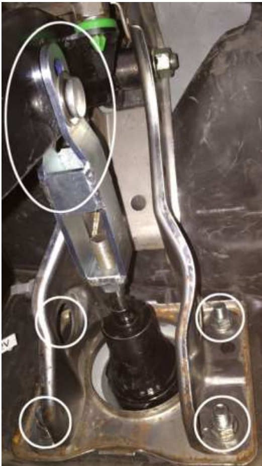
Image 2.2 Alignment of booster.

Note: A second set of hands make alignment during this process much easier