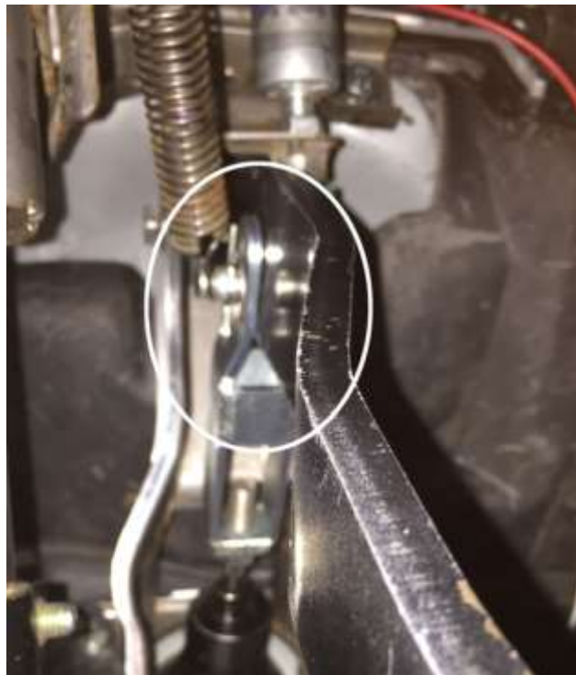
Image 2.3 Cotter pin install

Fit the factory Toyota pin with the supplied FW-5/16 washers on either side and install the cotter pin as per image 2.3