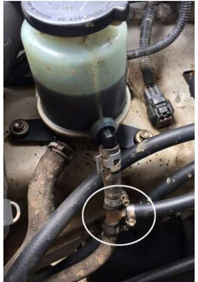
Image 4.1 Power reservoir tee

Secure the new hydraulic lines to your vehicle making sure they will not foul on things such as the steering coupling, exhaust etc. Depending on your engine bay you may be able to use P clips and or cable ties to secure the lines.